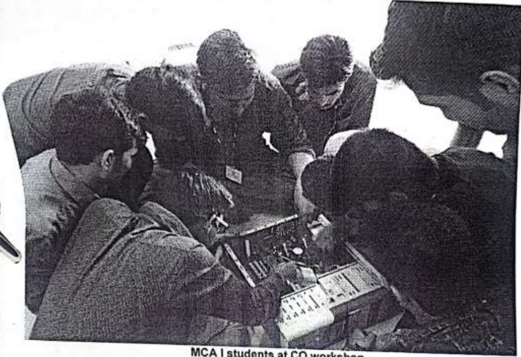
MCA I students at CO workshop